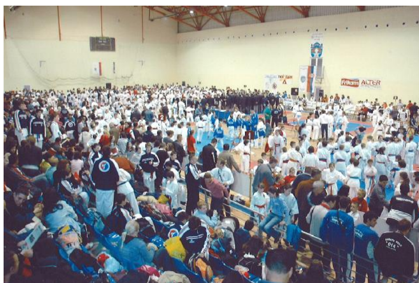
Golden Belt 2013