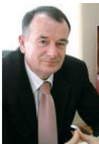
Co-President of OC Vojislav Ili Mayor of Cacak