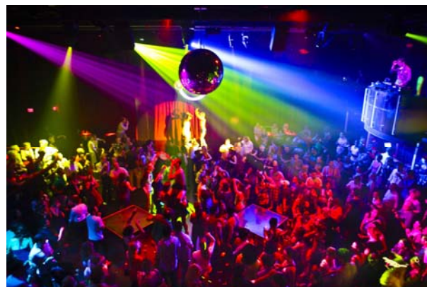
LIMASSOL BY NIGHT