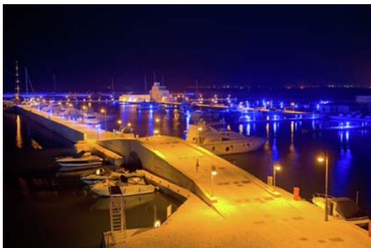
LIMASSOL MARINA - OLD HARBOUR