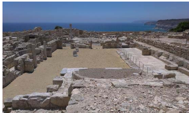
KOURION - Curium