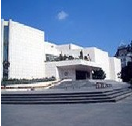
Novi Sad, Serbia, 2011