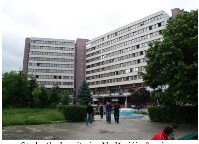
Student's dormitories Nedžarići - Sarajevo