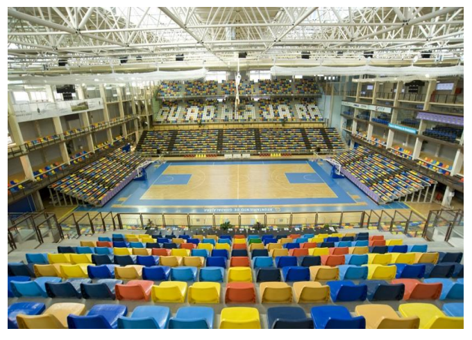
Address: Avenue El Vado, 13 19005 Guadalajara