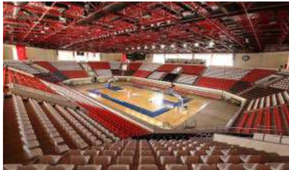
ŞAHİNBEY SPORT HALL