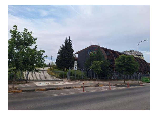
Address: Tirana, Str. Liman Kaba