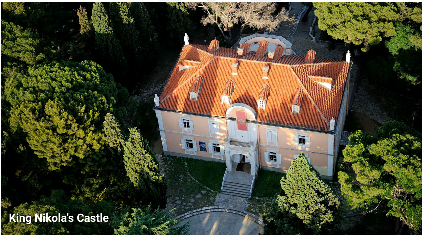
King Nikola's Castle

Podgorica's location near rivers and its historical significance make it an interesting destination for visitors, offering a blend of both ancient and modern attractions. Whether you're interested in exploring historical sites or enjoying the natural beauty of Montenegro, Podgorica has something to offer.