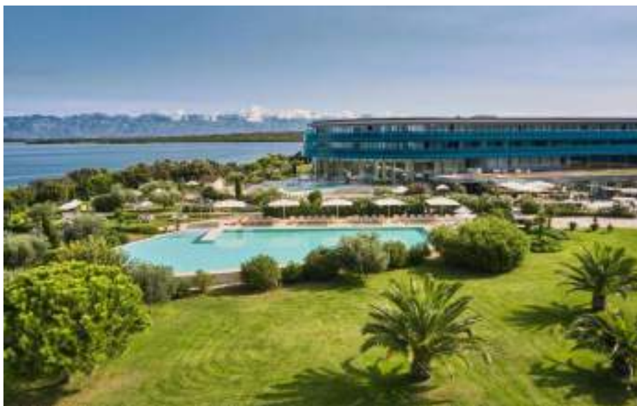
Resort Punta Skala Map