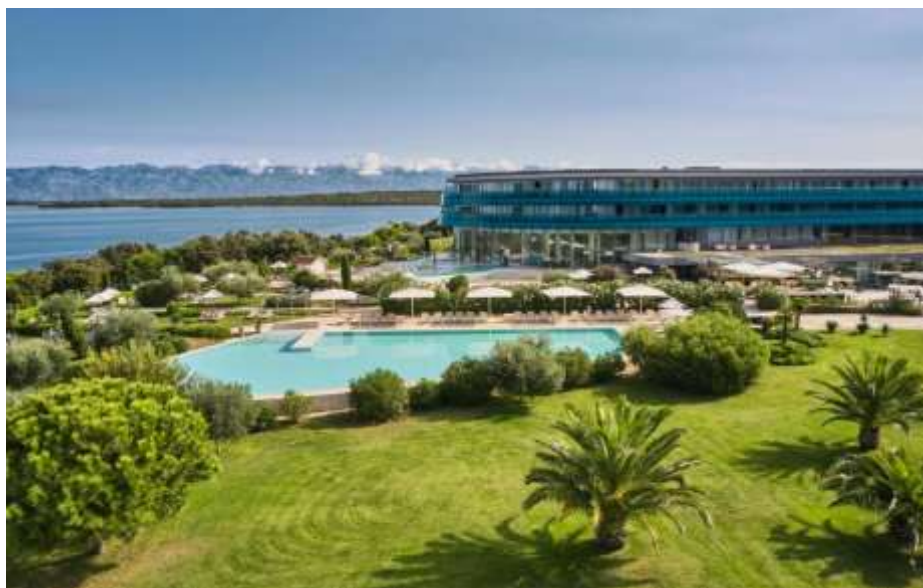
Resort Punta Skala Map