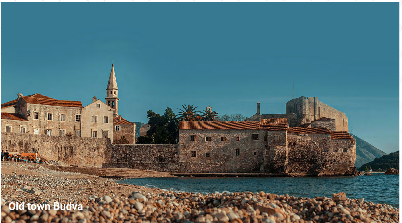
Old town Budva

For centuries, Budva was a thriving center of trade and culture, influenced by various civilizations including the Illyrians, Romans, Venetians, and Ottomans. Today, it is not only a cultural hub but also a modern destination known for its lively atmosphere, making it the ideal place to host international events like a karate competition.