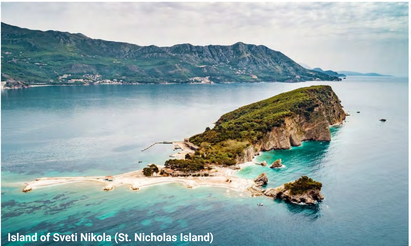
Island of Sveti Nikola (St. Nicholas Island)